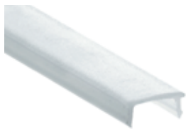
Polycarbonate cover 18.019 opal 2m