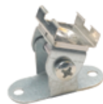
Adjustable bracket 20.004 chrome steel (clip not included)