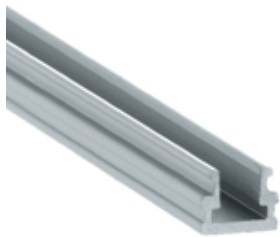
Aluminium profile 01.013 anodised silver 2m