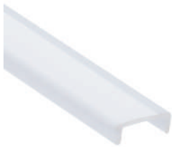
Polycarbonate cover 18.063 opal 3m