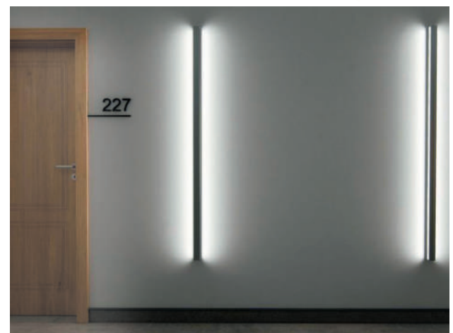
Option: aluminium skirting board