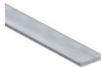
Inner plate 200cm