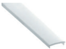
"easy-ON" polycarbonate cover (Up)