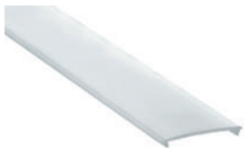
"easy-ON" polycarbonate cover (Down)