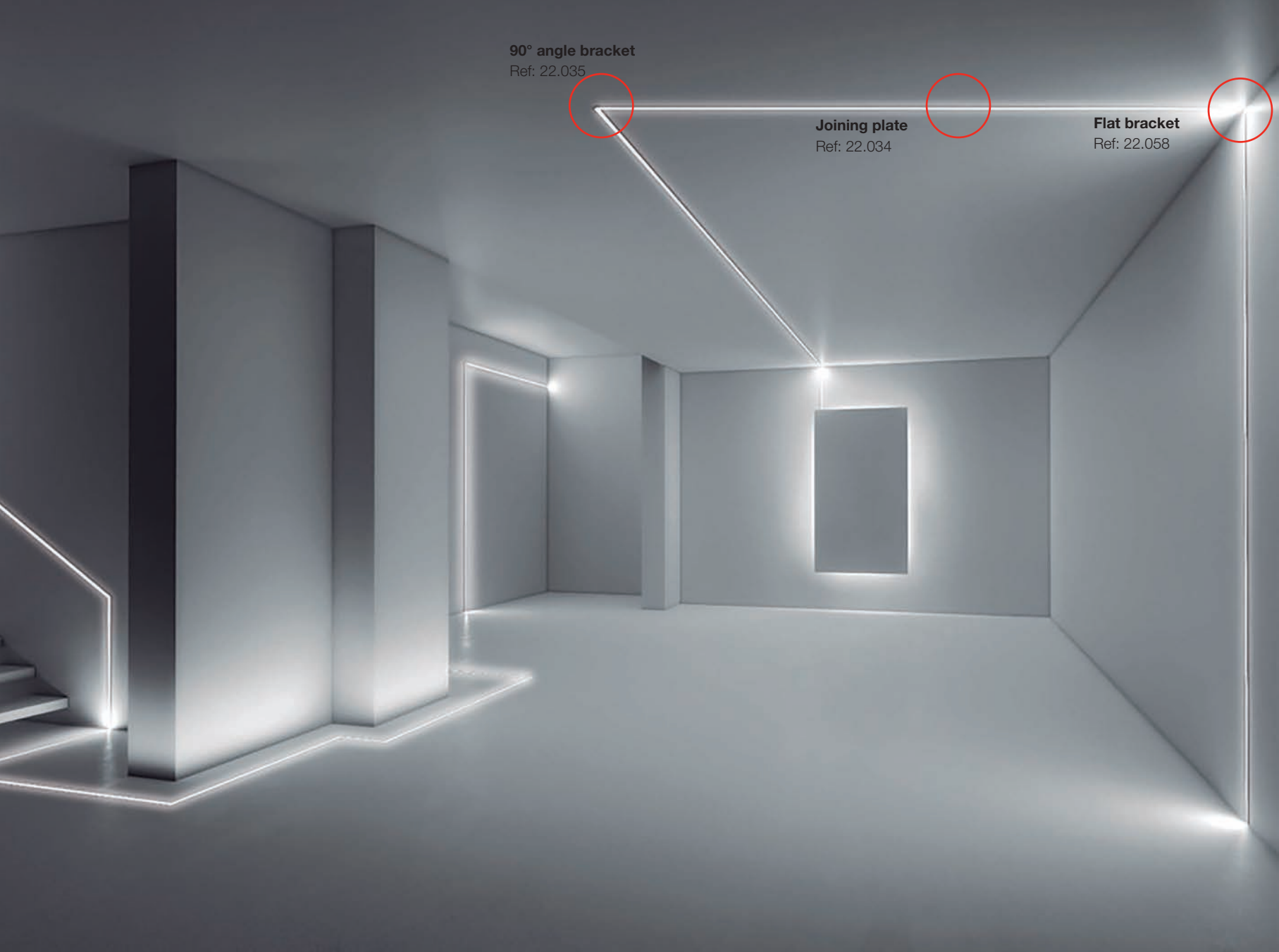
90° angle bracket