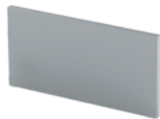
Aluminium endcaps 19.136 without hole