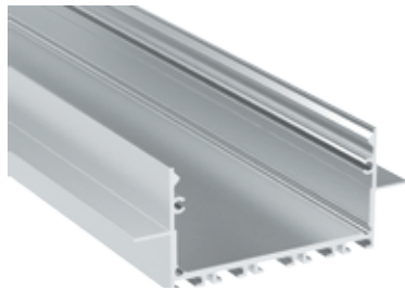
Aluminium profile 08.007 white lacquered 2m