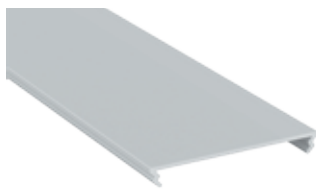
Polycarbonate cover 18.059 opal 2m