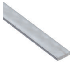
Inner plate 22.143 aluminium (2000x25x0.75mm)