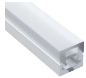
Neon Cuadrado XL Led

10.216 Neon cuadrado XL 1-100m (Max. PCB 10mm)